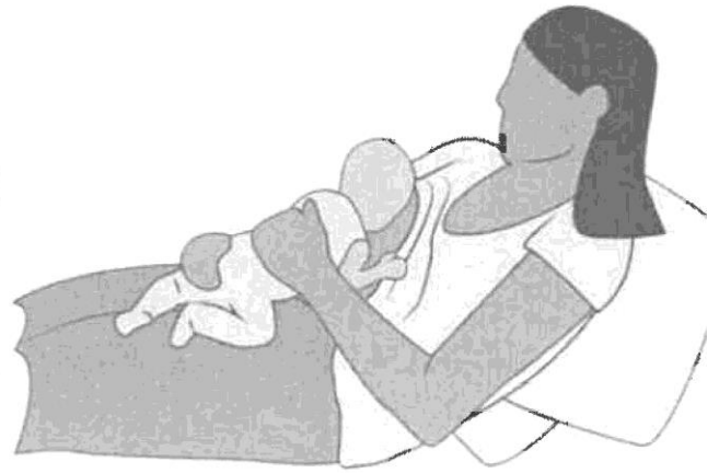
Figure 4. Biological breastfeeding