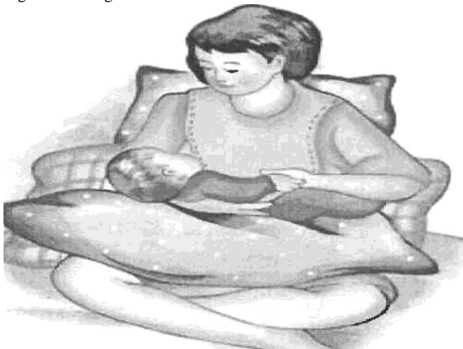
Figure 1. Sitting cradle hold