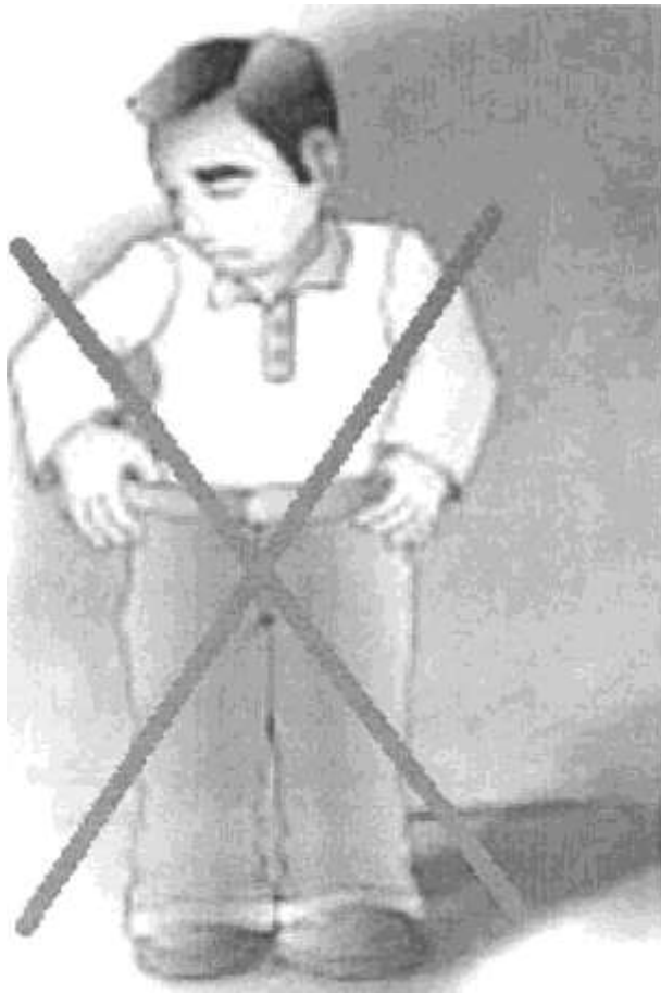
Figure 1: Inappropriately-sized pants